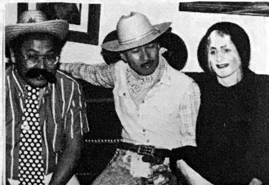
Photo from HTG Halloween party

The reforms are a result of lobbying efforts by the NGLTF and were a response to the boycott of the 6th International Conference on AIDS. HTG and many organizations around the world supported the boycott and called for reforms of the immigration policy.