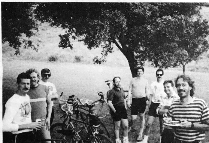
HTG members on a Saturday bike ride at Coyote Hills Regional Park.

These and many more are some of the things I hope to achieve in the coming year. With your help, I am confident of the future of High Tech Gays.